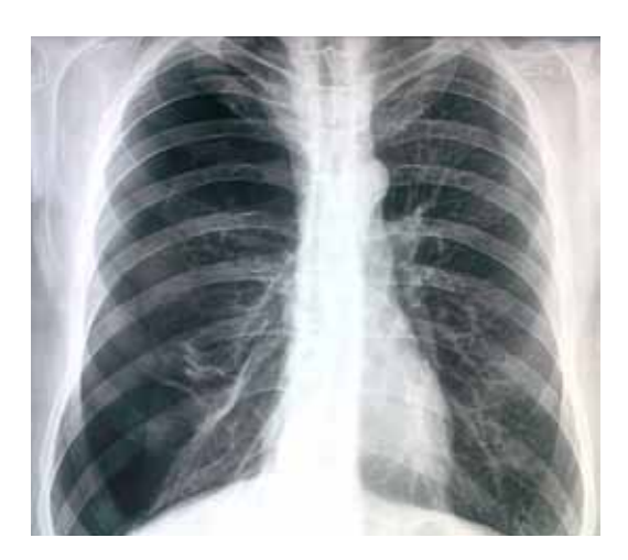
FIGURE 3. At initial examination our second patient presented with a right- sided pneumothorax.