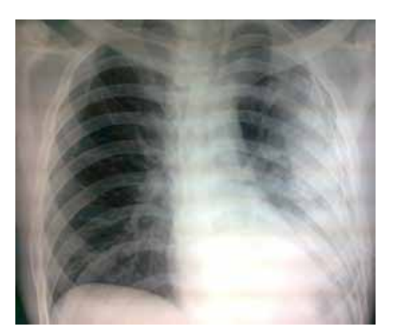
FIGURE 2. Almost one hour after a unilateral pulmonary oedema was presented.